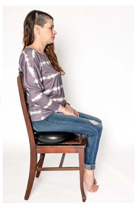
SITTING ON CHAIR WITH FLAT BASE